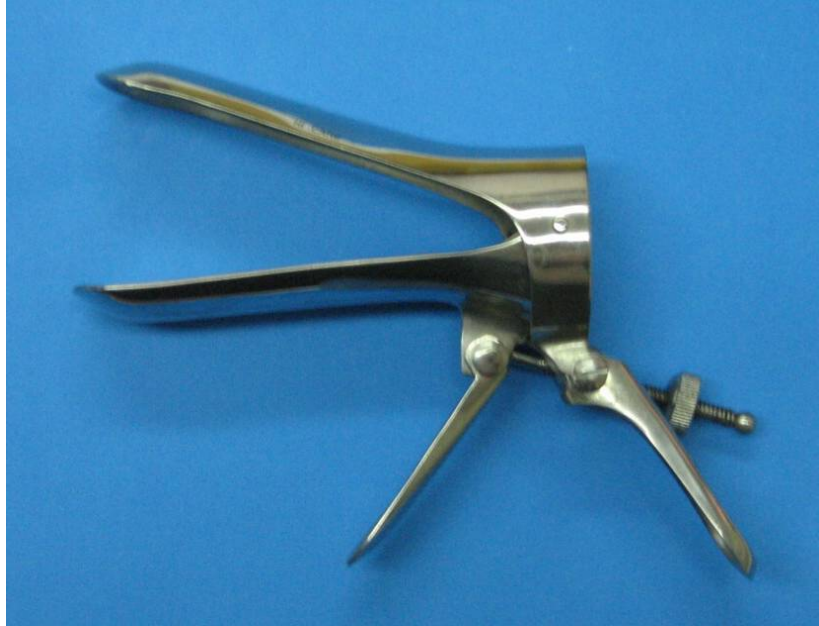
CODE : SPV